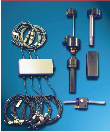
Standard tooling kit.

Standard in-die tooling is available to meet the needs for most applications. Custom designed tooling is also offered to meet the needs of your specific application. Please call us for more information about your requirements. We will be happy to assist you to design the proper tool for your assembly.